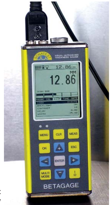
Large Digit View